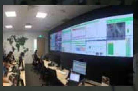
Control Tower, Singapore